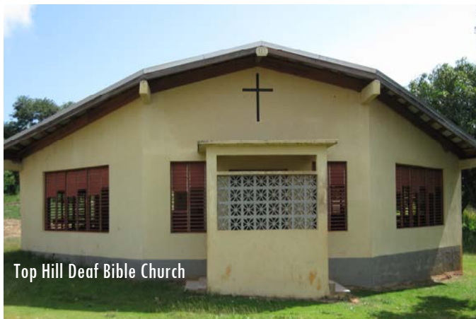
Top Hill Deaf Bible Church

To get this mission operating there is an immediate need to repair the roof. In order to make it usable, the needs include: beds, toilets, and kitchen utilities. If anyone has a heart to see this Deaf Church prosper, please contact us at AMD. We would love to take the time to share more of this vision with you.